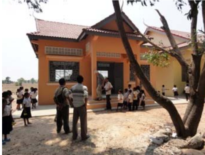
Library for 400 children at Cambodian rural elementary school